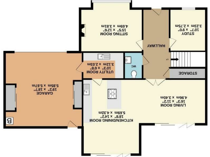
GROUND FLOOR 1353 sq.ft. (125.7 sq.m.) approx.