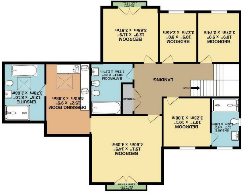
1ST FLOOR 1249 sq.ft. (116.0 sq.m.) approx.

TOTAL FLOOR AREA: 2602 sq.ft. (241.7 sq.m.) approx. Measurements are approximate. Not to scale. Illustrative purposes only. Made with Metropix ©2025